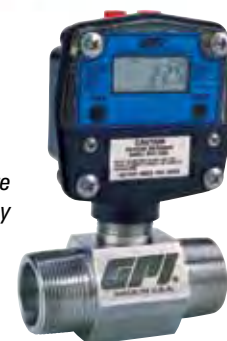
GNP shown here with Local Display

For complete part number, see "Number Reference" chart on page 5.